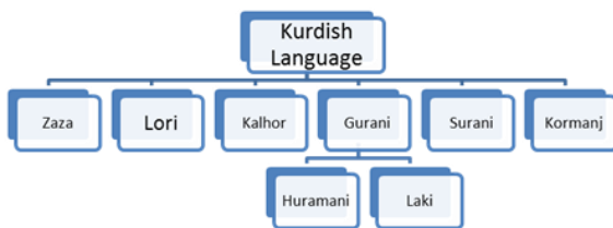
Estimated Population distribution and Kurds Territories

Kurds do not have unified language. Kurdish language is a rare Middle Eastern Language that has a few Arabic religious terms. Kurdish language includes six dialects: Kormanj, Surani, Gurani, Kalhor, Lori and Zaza( or deylami) which are spoken in different parts of Kurdistan territory today. (Yasemi, 1983, 129)